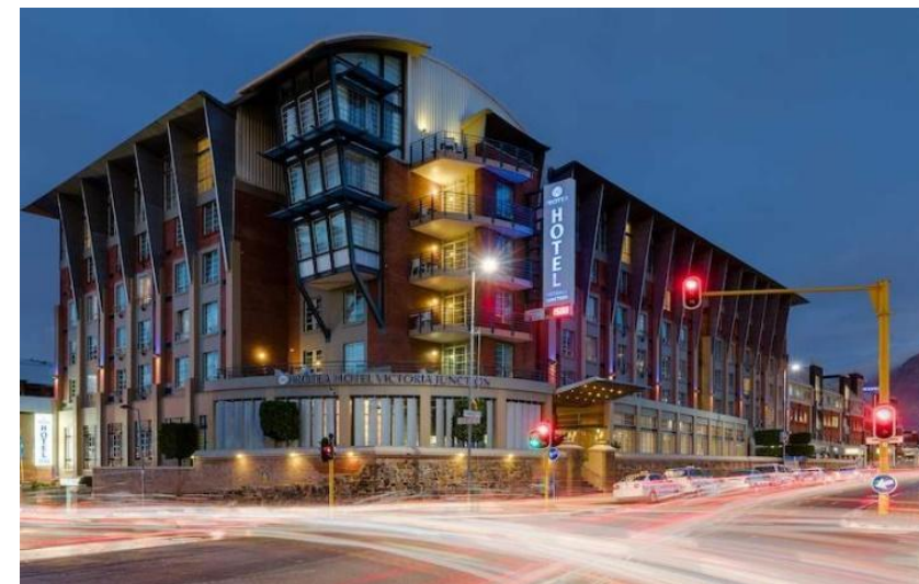
Garden Court Victoria Junction, Cape Town