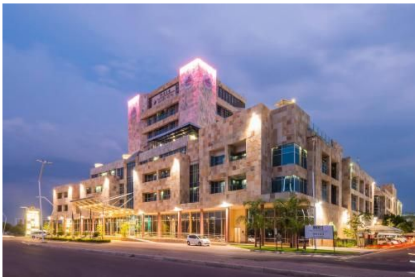
Masa Square, Gaborone