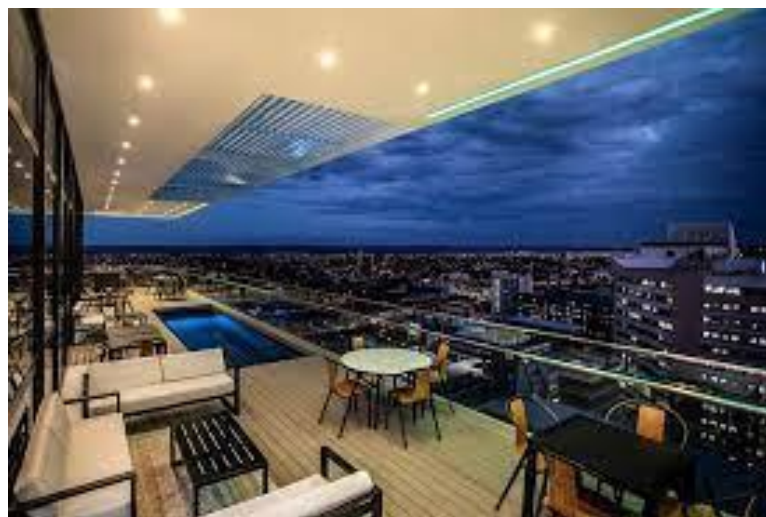
Avani Hotel, Windhoek