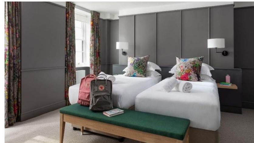
The Metropolitan Hotel, Dubai