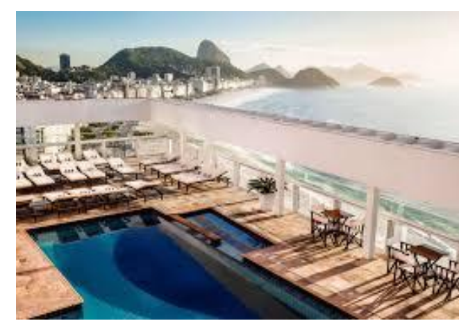
Wyndham Sao Paulo Paulista